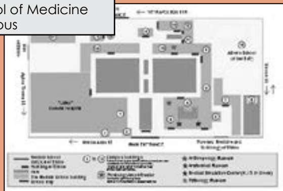
School of Medicine Campus